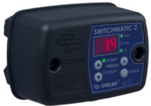
SWITCHMATIC 1 SWITCHMATIC 2 SWITCHMATIC 2/in-out